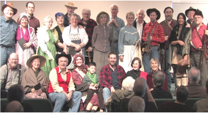
Held February 15 at the Heritage Center, "The Road to Statehood Ran Through Tualatin" cast members